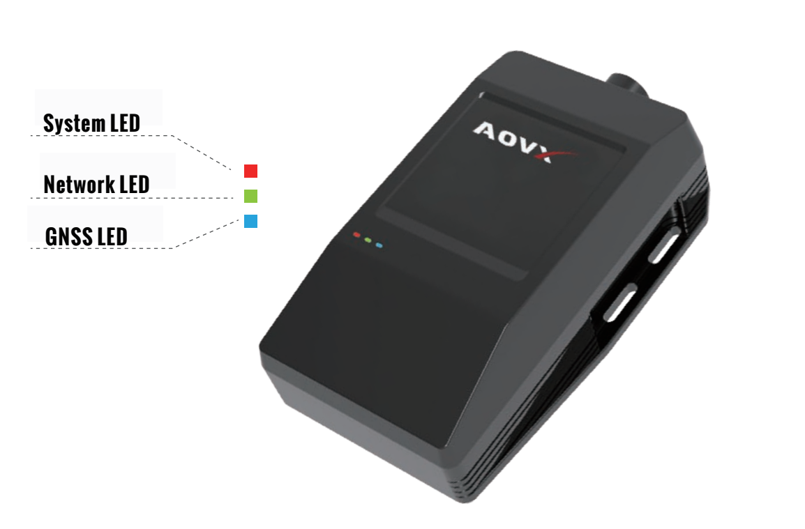
VEHICLE TRACKING V SERIES